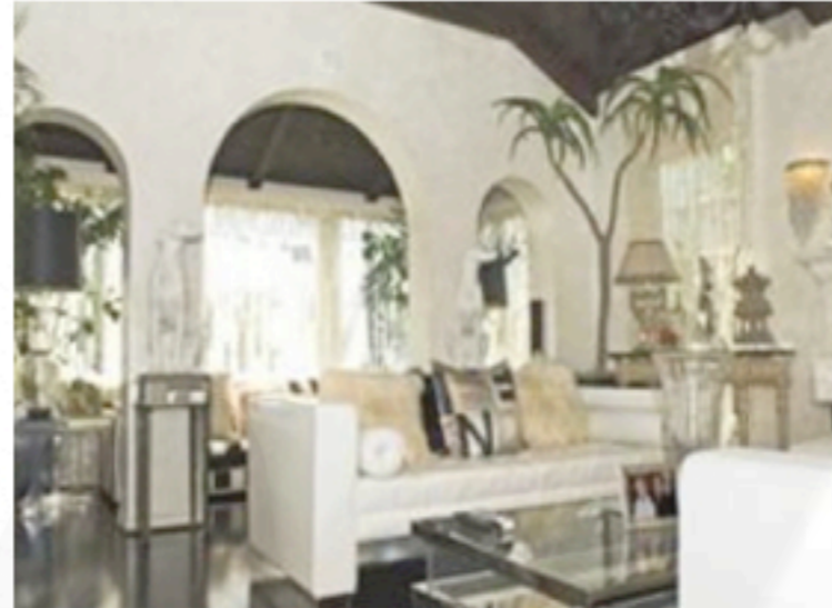
View Larger Map